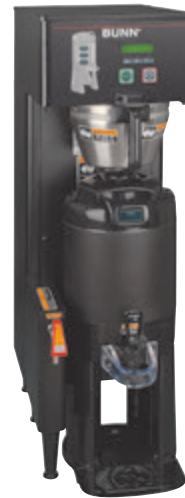
Single TF (Black)