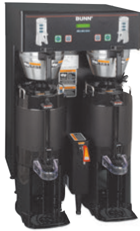
Dual TF (Black)