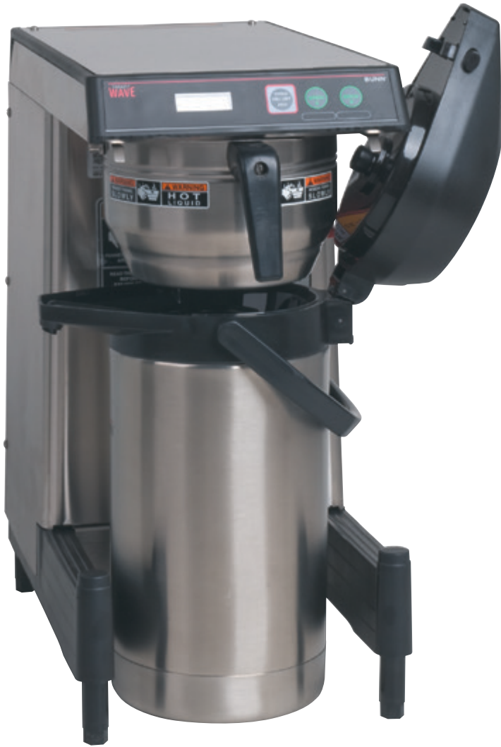
WAVE Specialty (with Gourmet C funnel)