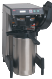
WAVE Standard (with legs extended)