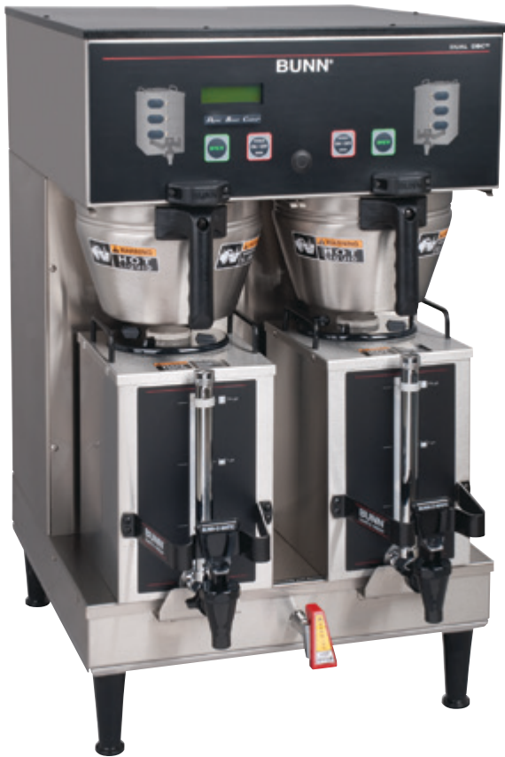
Dual GPR DBC