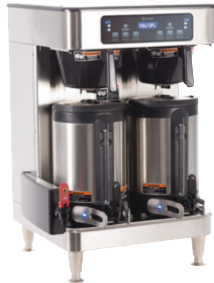
Infusion Series® Twin Soft Heat® (Stainless)

2016 AND EARLIER INFUSION SERIES® EQUIPMENT AVAILABLE BY CONTACTING YOUR BUNN REPRESENTATIVE OR VISITING BUNN.COM