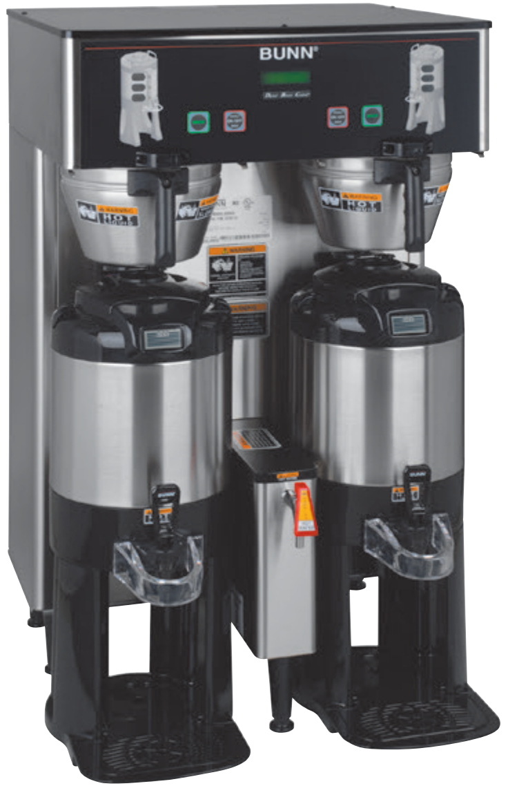
Dual TF (Stainless)