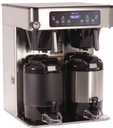
ICB Twin (Stainless)

Brew into 2.5-3.8L airpots or 1gal and 1.5gal ThermoFresh® servers without stand; also available in a Tall model designed to brew into servers with stand