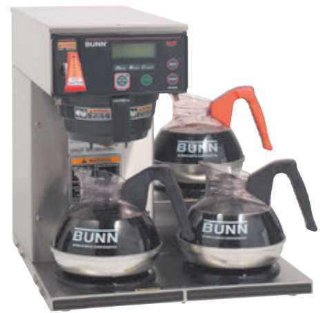
AXIOM 15-3 (Lower Warmers)