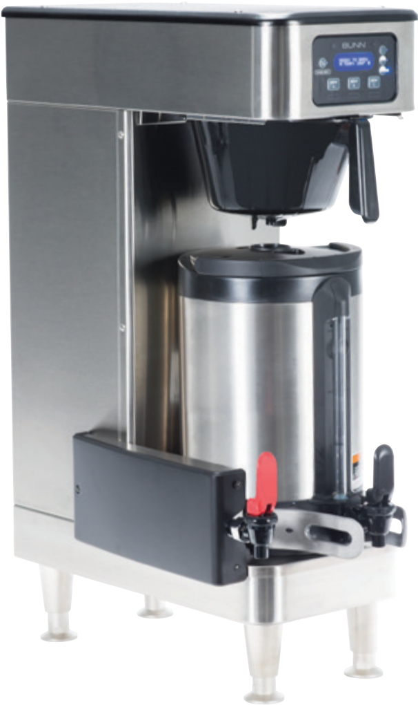
Infusion Series® Soft Heat® (Stainless)

Exclusive multi-directional lime resistant sprayhead provides the ultimate in uniformity of extraction