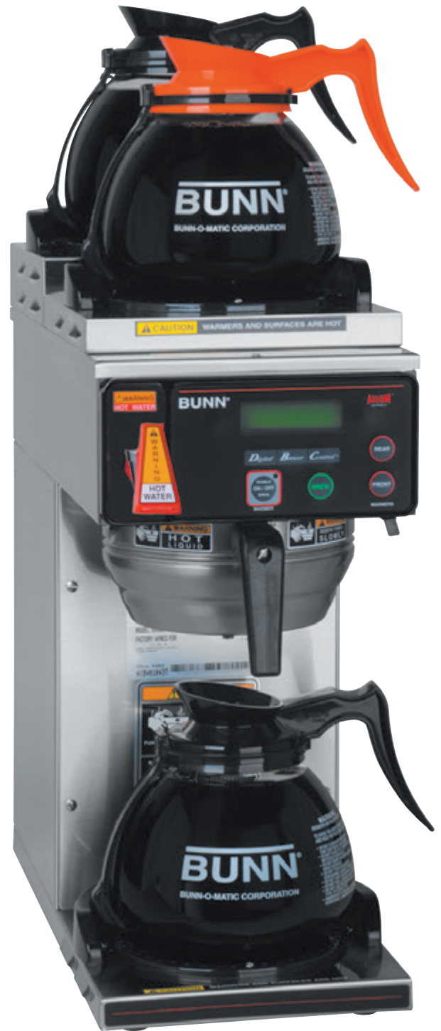
AXIOM DV-3 RFID (Upper Warmers)

Large 200oz (5.9L) tank provides back-to-back brewing capacity