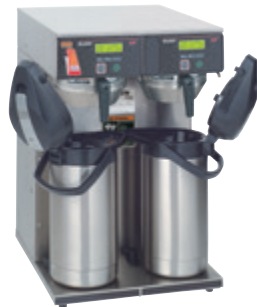
AXIOM Twin APS