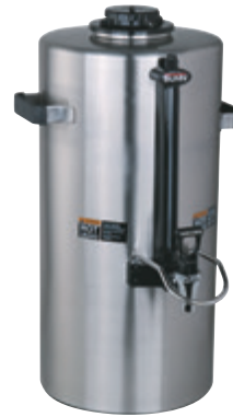
Titan TF Server (3 gal)