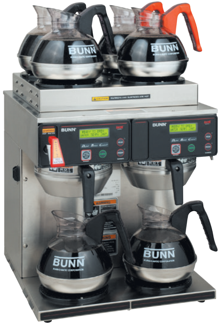
AXIOM DBC 4/2