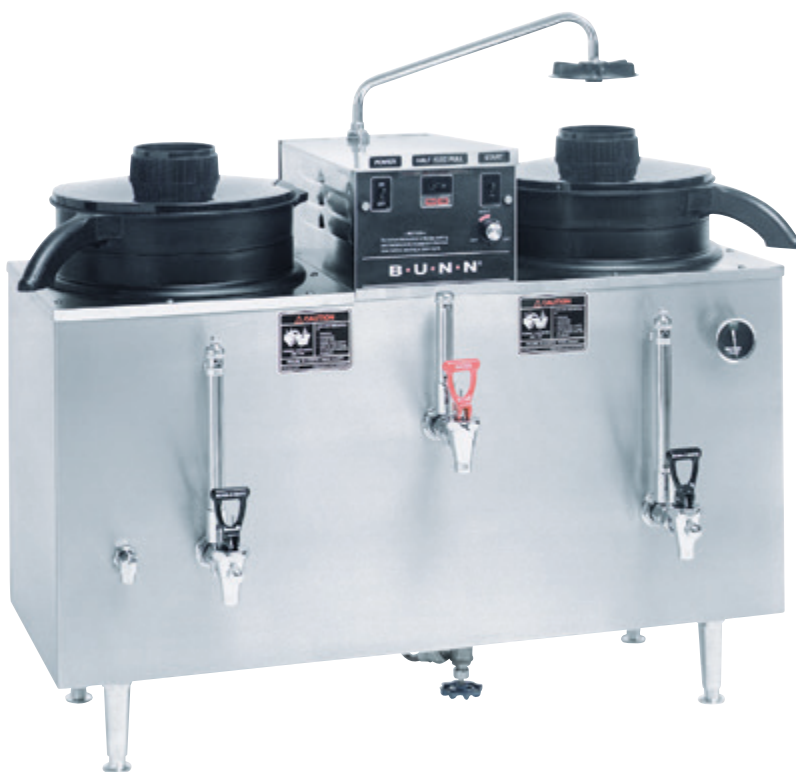
U3 - Twin

Draw off hot water during brew cycle without affecting coffee quality