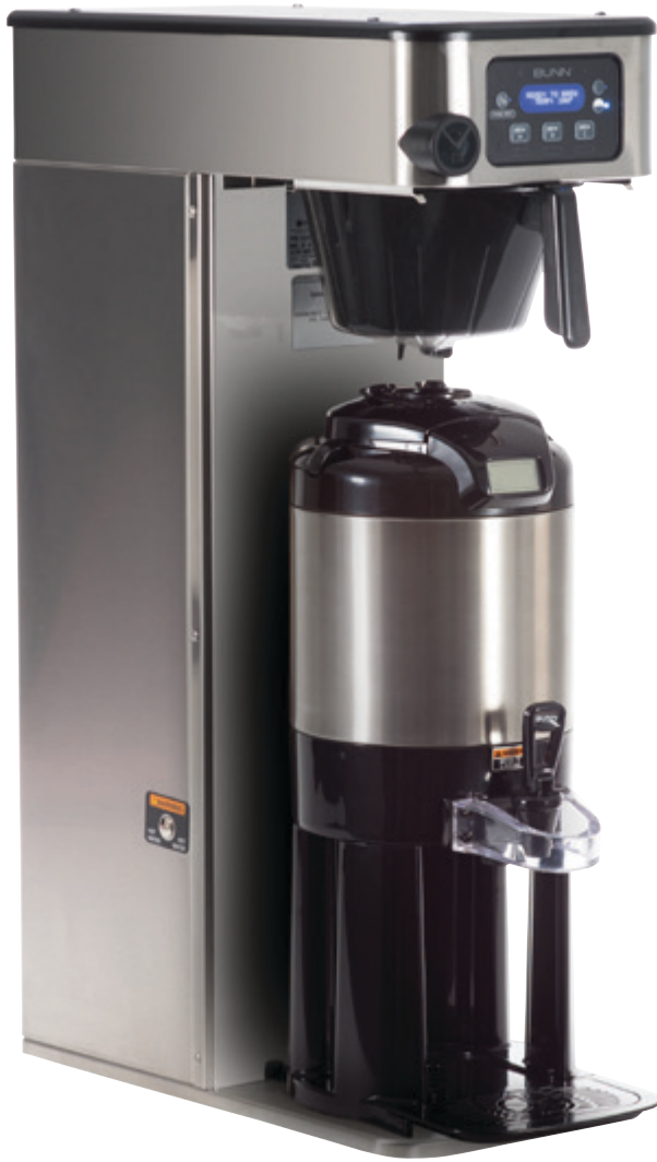
ICB DV Tall

Dual voltage model; can operate at 120V/15 amp or 120/208-240V/17amp