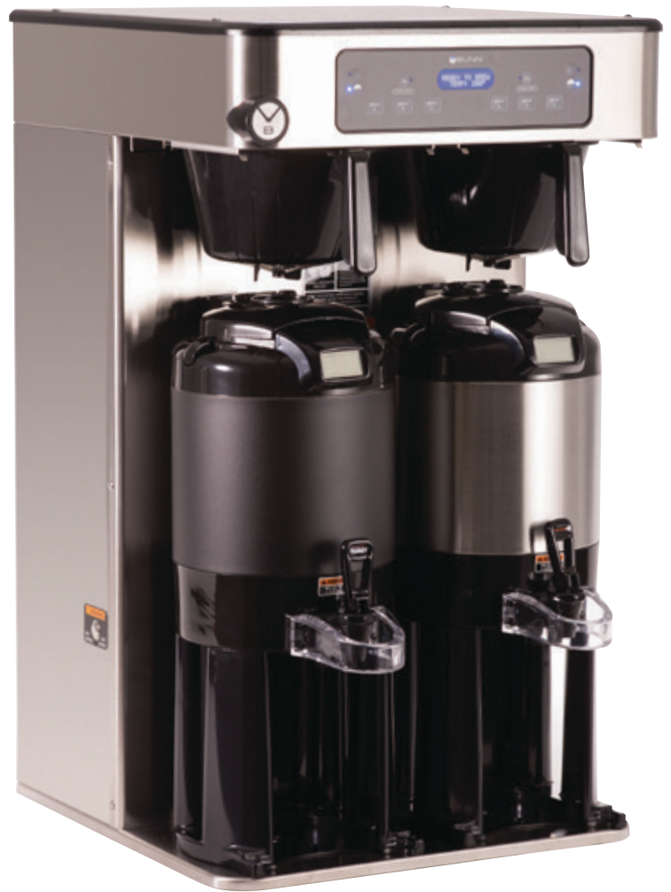
ICB Twin Tall (Stainless)