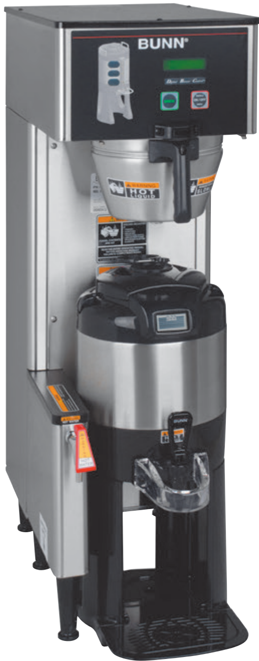
Single TF (Stainless)