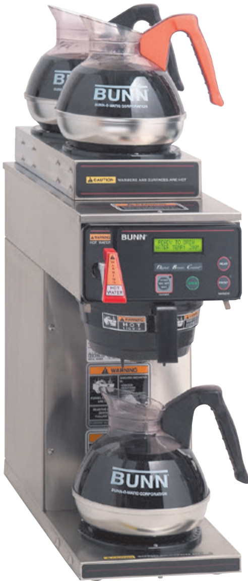
AXIOM 15-3 (Upper Warmers)

Coffee extraction controlled with programmable features