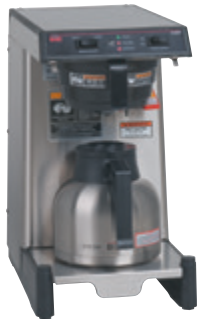
WAVE Silver (with booster tray extended)