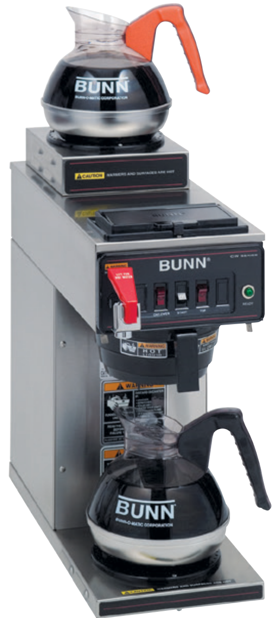
CWTF15 (with faucet)