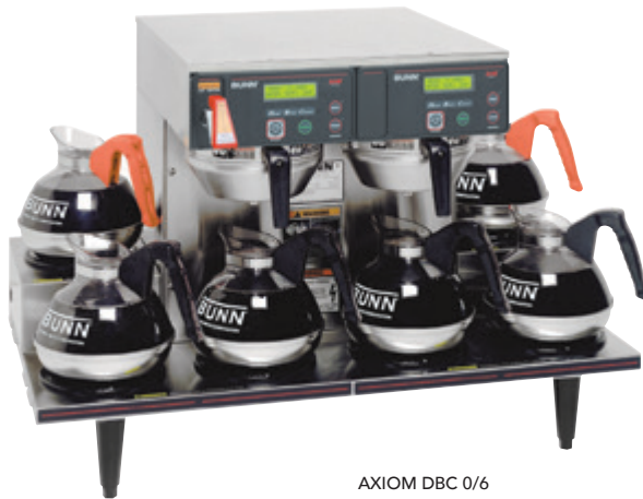
AXIOM DBC 0/6

Six individually controlled warmers available in either lower or upper/lower design