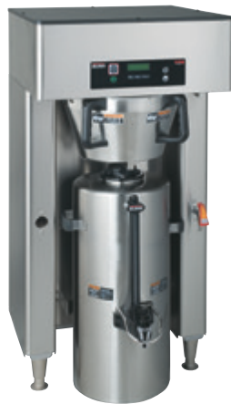
Titan DBC Single