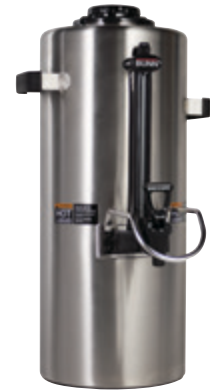
Titan TF Server (1.5 gal)