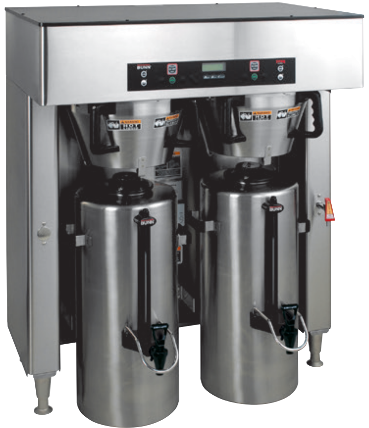
Titan DBC Dual

Large cup clearance for a variety of dispensing options