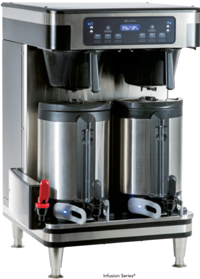
Infusion Series® Twin Soft Heat®

Exclusive multi-directional lime resistant sprayhead provides the ultimate in uniformity of extraction