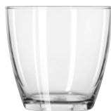
Rocks No. 1513 ★ ● 9 oz./26.6 cl./266 ml. H3% T3% B2 D3% 3 doz./16# • 1.0 cu. ft. SCC 409751