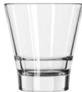
Rocks No. 15710 + 9 oz./26.6 cl./266 ml. H3% T3% B2% D3½ 1 doz./8# • .45 cu. ft. SCC 367112