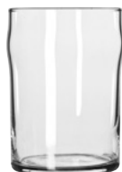
Water No. 1910HT ★ ● 10 oz./29.6 cl./296 ml. H3% T2% B2% D2% 4 doz./15# • 1.17 cu. ft. SCC 369963