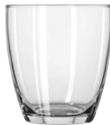
Rocks No. 1512 ★ ● 10½ oz./31.1 cl./311 ml. H3% T3% B2 D3% 3 doz./16# • 1.08 cu. ft. SCC 409133