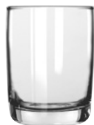
Room Tumbler No. 135 ● 8 oz./23.7 cl./237 ml. H3% T2% B2% D2% 4 doz./23# • 1.02 cu. ft. SCC 369901