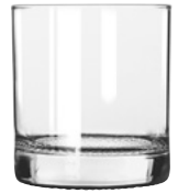
Rocks No. 9171CD ▲ ● 11 oz./32.5 cl./325 ml. H3% T3% B3% D3% 3 doz./26# • 1.05 cu. ft. SCC 087051