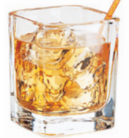
Rocks No. 5279 9 oz./26.6 cl./266 ml. H3% T3 B2% D3 3 doz./34# • .91 cu. ft. SCC 766468