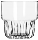
Rocks No. 15434 + 9 oz./26.6 cl./266 ml. H3% T3% B2% D3% 3 doz./24# • .99 cu. ft. SCC 173938