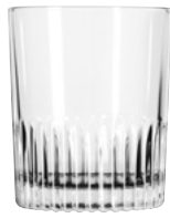
Rocks No. 15626 + 8½ oz./25.1 cl./251 ml. H3% T3 B2% D3 3 doz./23# • .87 cu. ft. SCC 005168