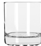
Old Fashioned No. 23386 ● 10¼ oz./30.3 cl./303 ml. H3% T3% B3% D3% 2 doz./16# • .69 cu. ft. SCC 370181