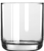
Room Tumbler No. 494 ● 10 oz./29.6 cl./296 ml. H3% T3% B2% D3% 1 doz./8# • .30 cu. ft. SCC 121847