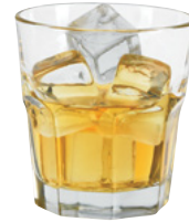
Rocks No. 15232 + 10 oz./29.6 cl./296 ml. H3% T3% B2% D3% 3 doz./27# • 1.19 cu. ft. SCC 105373