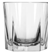
Rocks No. 15481 + 9 oz./26.6 cl./266 ml. H3% T3% B3% D3% 3 doz./35# • 1.07 cu. ft. SCC 831104