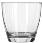
Rocks No. 1514 ★ ● 7 oz./20.7 cl./207 ml. H2% T3 B1% D3 3 doz./12# • .74 cu. ft. SCC 410177