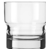
Rocks No. 12037 ★ ● 10 oz./29.6 cl./296 ml. H3% T3% B2% D3% 1 doz./8# • .33 cu. ft. SCC 687180