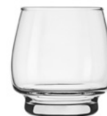
Rocks No. 12018 ★ ● 10 oz./29.6 cl./296 ml. H3% T2% B2% D3% 1 doz./5# • .33 cu. ft. SCC 686756