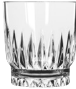
Rocks No. 15457 + 10 oz./29.6 cl./296 ml. H3% T3% B2% D3% 3 doz./23# • .93 cu. ft. SCC 030125