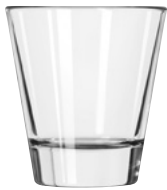
Rocks No. 15809 + 9 oz./26.6 cl./266 ml. H3% T3% B2% D3½ 1 doz./8# • .45 cu. ft. SCC 391896