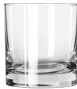
Rocks No. 917CD ▲ ● 11 oz./32.5 cl./325 ml. H3% T3% B3% D3% 3 doz./26# • 1.06 cu. ft. SCC 756513