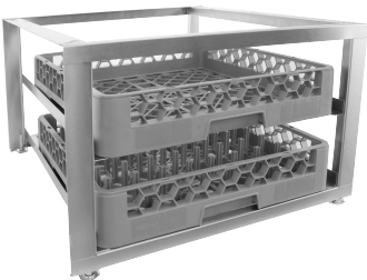
Stainless Steel Pedestal 24"W X 25-3/8"D X 15-1/4"H