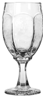
Wine No. 3264 ■ 8 oz./23.7 cl./237 ml. H6¼ T2% B2% D3 3 doz./20# • 1.46 cu. ft. SCC 717774

See page 311 for matching Chivalry tumblers.