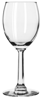
Tall Wine No. 8766 ● 6½ oz./19.2 cl./192 ml. H6½ T2¼ B2% D2% 3 doz./13# • 1.39 cu. ft. SCC 090621