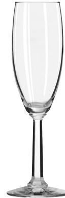
Flute No. 8795 ● 5¾ oz./17.0 cl./170 ml. H7% T1% B2% D2% 1 doz./5# • .54 cu. ft. SCC 574698