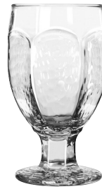
Banquet Goblet No. 3211 ■ 10½ oz./31.1 cl./311 ml. H5% T2% B2% D3¼ 2 doz./14# • .96 cu. ft. SCC 369970