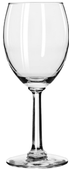
White Wine No. 8764 ● 7¾ oz./22.9 cl./229 ml. H6¾ T2¾ B2% D2¾ 3 doz./14# • 1.49 cu. ft. SCC 090563