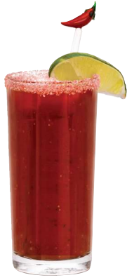
Beverage No. 1790845 12 oz./35.5 cl./355 ml. H5½ T2¼ B2¼ D2¼ 2 doz./20# • .77 cu. ft. SCC 17908457