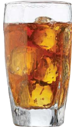
Beverage No. 2488 ● 12 oz./35.5 cl./355 ml. H5¼ T2% B2¼ D3% 3 doz./26# • 1.33 cu. ft. SCC 753857