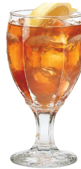
Goblet No. 3212 ■ 12 oz./35.5 cl./355 ml. H6½ T3¼ B3 D3% 3 doz./30# • 2.16 cu. ft. SCC 716128