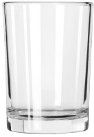
Tumbler No. 1789821 9 oz./27.0 cl./270 ml. H4 T2% B2½ D2% 2 doz./15# • .60 cu. ft. SCC 17898215