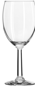
Goblet No. 8756 ● 10¼ oz./30.3 cl./303 ml. H7% T2% B2% D3 3 doz./16# • 1.81 cu. ft. SCC 090655