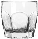
Rocks No. 2485 ● 10 oz./29.6 cl./296 ml. H3¾ T3¼ B2% D3% 3 doz./24# • 1.12 cu. ft. SCC 753819