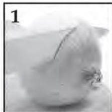
1 Slice and remove onion top.

Combine ingredients in bowl. Gradually pour in 3/4 Cup/180ml flat beer, stirring constantly. Cover and refrigerate at least 3 hours. Beat egg whites until stiff and add to mixture just before using.