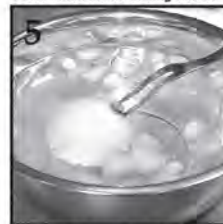
5 Place in ice water for 3 minutes.