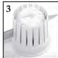
3 Slice onion using all guide slots.