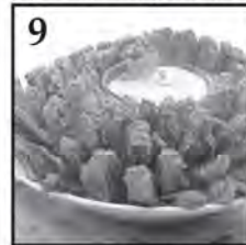
9 Enjoy with your favorite sauce!