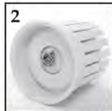
2 Place onion inside Slicing Guide.