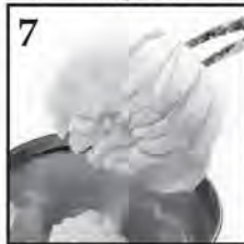
7 Batter onion, place in hot oil.