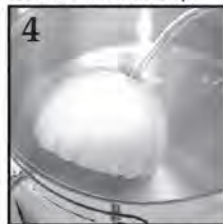
4 Place in simmering water for 1 minute.