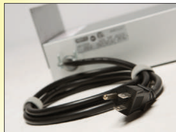
Optional cord-and-plug units simplify installation.