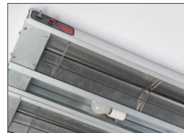
Optional showcase lighting adds visual appeal.