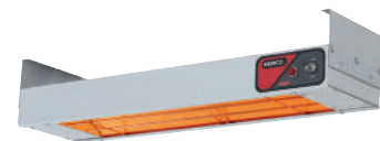
Model 6150-24, with hanging brackets