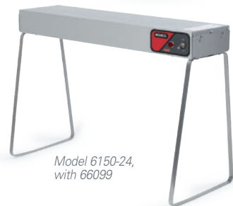
Model 6150-24, with 66099

Power option: Standard on/off toggle switch (shown) or 'infinite' temperature control dial for varying low, medium and high heat settings.