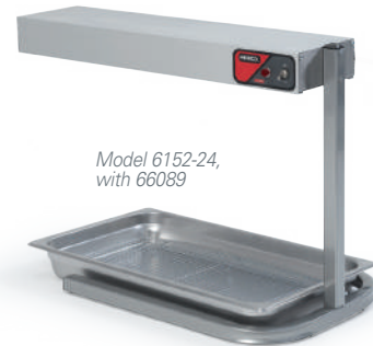
Model 6152-24, with 66089