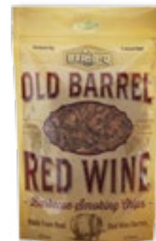
Old Barrel Red Wine 05040BC

Case Pack: 6 Case Pack Weight: 5.5 lb Case Pack Dimensions: 10.6 in x 9.3 in x 11.8 in Case Cube: 0.68 cu ft