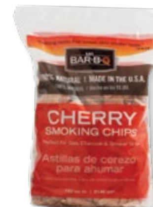
Cherry Smoking Chips 05017Y