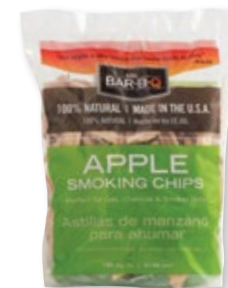
Apple Smoking Chips 05012Y