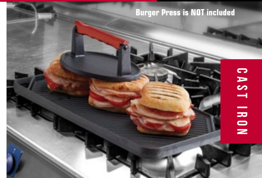
Burger Press is NOT included