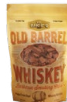
Old Barrel Whiskey 05042BC