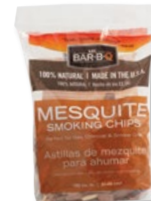
Mesquite Smoking Chips 05010Y