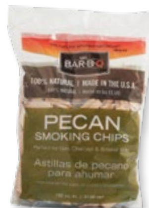
Pecan Smoking Chips 05019Y