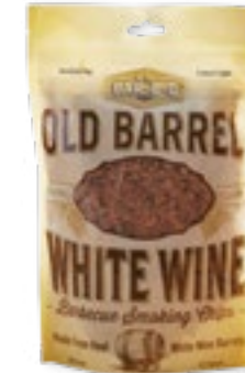
Old Barrel White Wine 05041BC