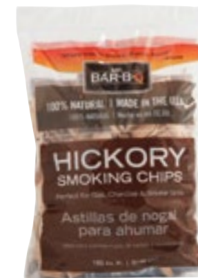
Hickory Smoking Chips 05011Y

Case Pack: 4 Case Pack Weight: 8 lb Case Pack Dimensions: 13.8 in x 11.3 in x 7 in Case Cube: 0.64 cu ft