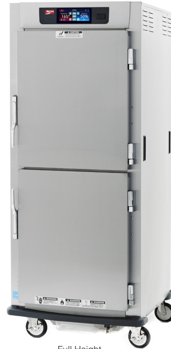
Full Height Dutch Solid Doors