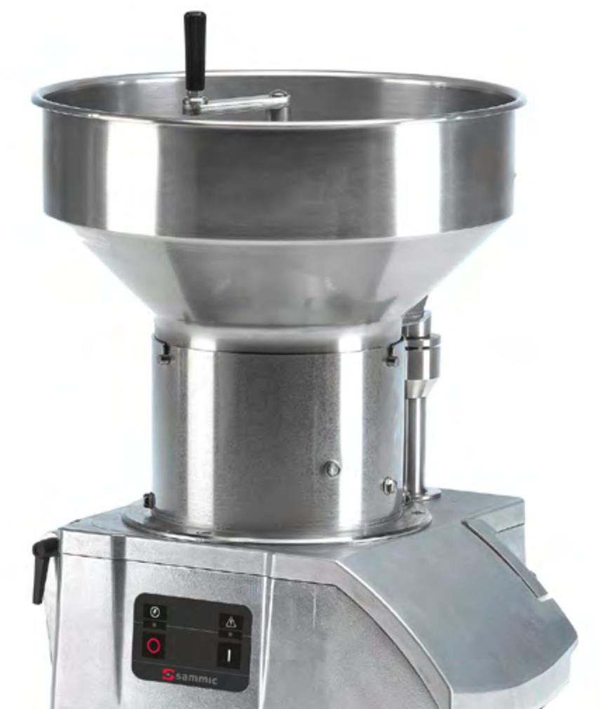
Long vegetable attachment