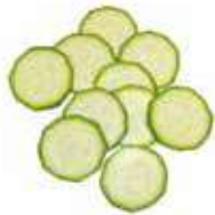
Rippled slicing disc