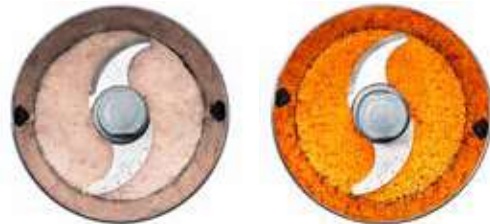
Hub with smooth blades

The flat blades are indicated for cutting raw meat , because the edge and its shape can easily cut the nerve strands and difficult points of the meat. They are also recommended for vegetables in general , including onion, as it chops very well with only a small quantity of liquid from the product.