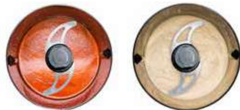
Hub with perforated blades

Use the perforated blades to make sauces and mix products such as mayonnaise, seafood cocktail sauce, aioli garlic mayonnaise , etc. as well as for certain types of pastry dough .