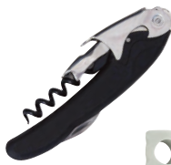
Professional Waiter's Corkscrew With Paring Knife - Black CR-1148