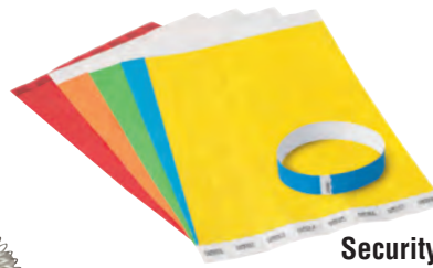
Security Wristbands * "No Tear" 3/4" Tyvek® Material Waterproof with Super Adhesive

WB-100R RED WB-100B BLUE WB-100G GREEN WB-100Y YELLOW WB-100O ORANGE WB-100PU PURPLE WB-100PI PINK OTHER DESIGNS AVAILABLE