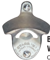
Bottle Opener Wall Mount With Screws CR-1278