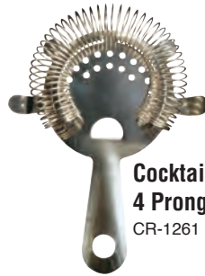
Cocktail Strainer 4 Prong - Stainless Steel CR-1261