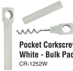
Pocket Corkscrew White - Bulk Pack Only CR-1252W