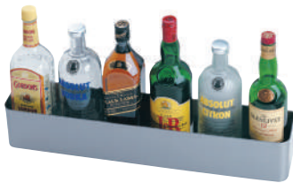
Single Speed Rail S-24 shown