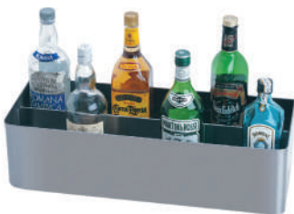
Double Speed Rail D-24 shown