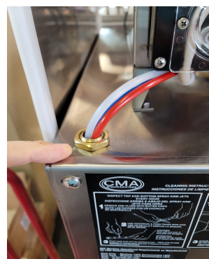
Chemical lines through new tube