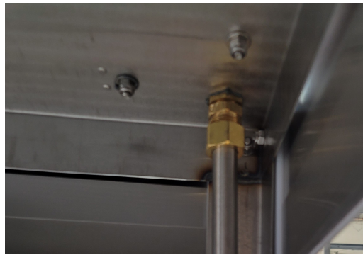
Compression fitting with stainless steel tube