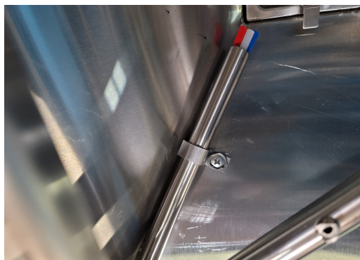
Clamp on stainless steel tube