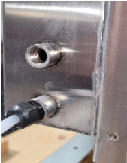
Sanitizer line before and plugged