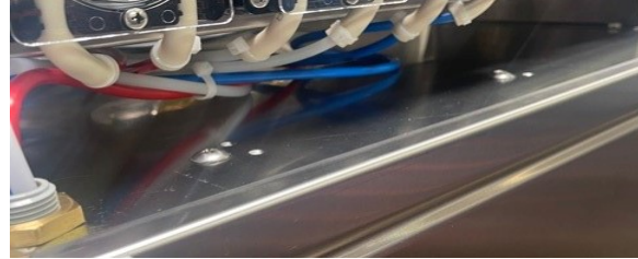
Detergent and Rinse Additive holes plugged