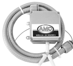
Low Chemical Alarm