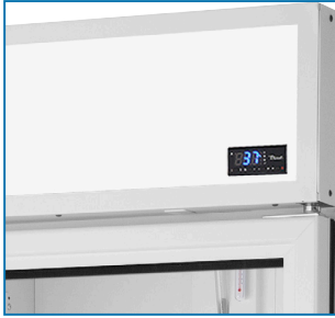
Standard: Display in sign frame.

Swing Door Scientific Refrigerator with Hydrocarbon Refrigerant~True Standard Look Version 01