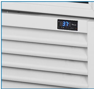
Optional: Display in Grill. Must be indicated at time of order.