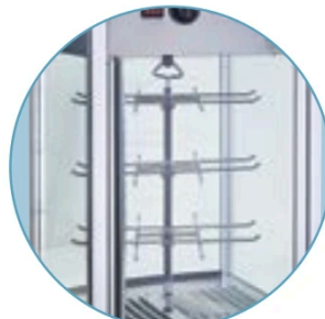
EDM-2PR Optional Pretzel Rack