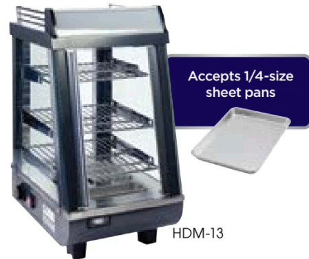
Accepts 1/4-size sheet pans