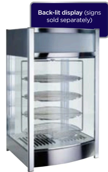
Back-lit display (signs sold separately)