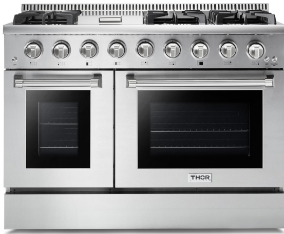
Product: 48 Inch Professional 6 Burner Gas Range in Stainless Steel Model Number: HRG4808U / HRG4808ULP