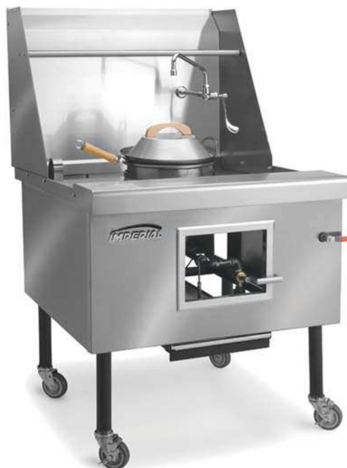
ICRA-1 shown with optional casters

3-ring burner has two adjustable gas valves for inner and outer rings.