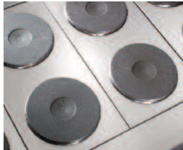
9" (229 mm) sealed round plate elements with easy to clean flat surface.

IR-6-E IR-G36T-E IR-6-E-C IR-G36T-E-C IR-6-E-XB IR-G36T-E-XB