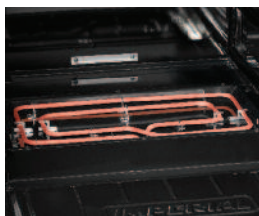
5.3 KW element provides even heating throughout the oven cavity.