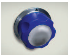
Durable cast aluminum with a Valox™ heat protection grip.