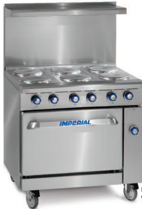
IR-6-E shown with optional casters