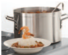
Large 5" (127 mm) stainless steel landing ledge for convenient plating.