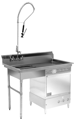
48" Undercounter dishtable with Pre-Rinse