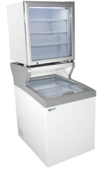
MCT-2HC with optional CTF-3HC countertop freezer