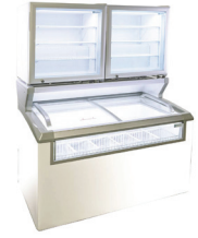
Double Combo-MCT-4HC with 2 optional CTF-3HC