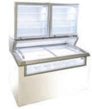
Double Combo-MCT-4HC with 2 optional CTF-3HC