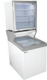
Combo MCT-2HC with 1 optional CTF-3HC