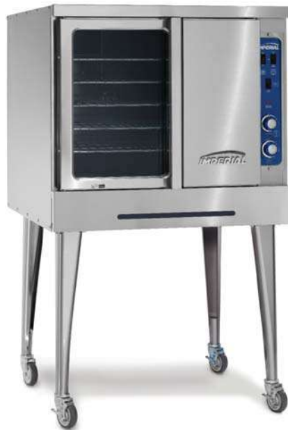
ICVE-1 shown with optional casters

Four bearings per door extend the life of the door mechanism.