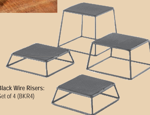
Black Wire Risers: Set of 4 (BKR4)

Our displays, stands and riser are available in various sizes and finishes to elevate and organise your operators' presentation needs.