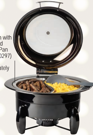
ROUND CHAFER Stainless Steel with Black PVD Coating (10436)

Shown with Divided Food Pan (CW40297) sold separately