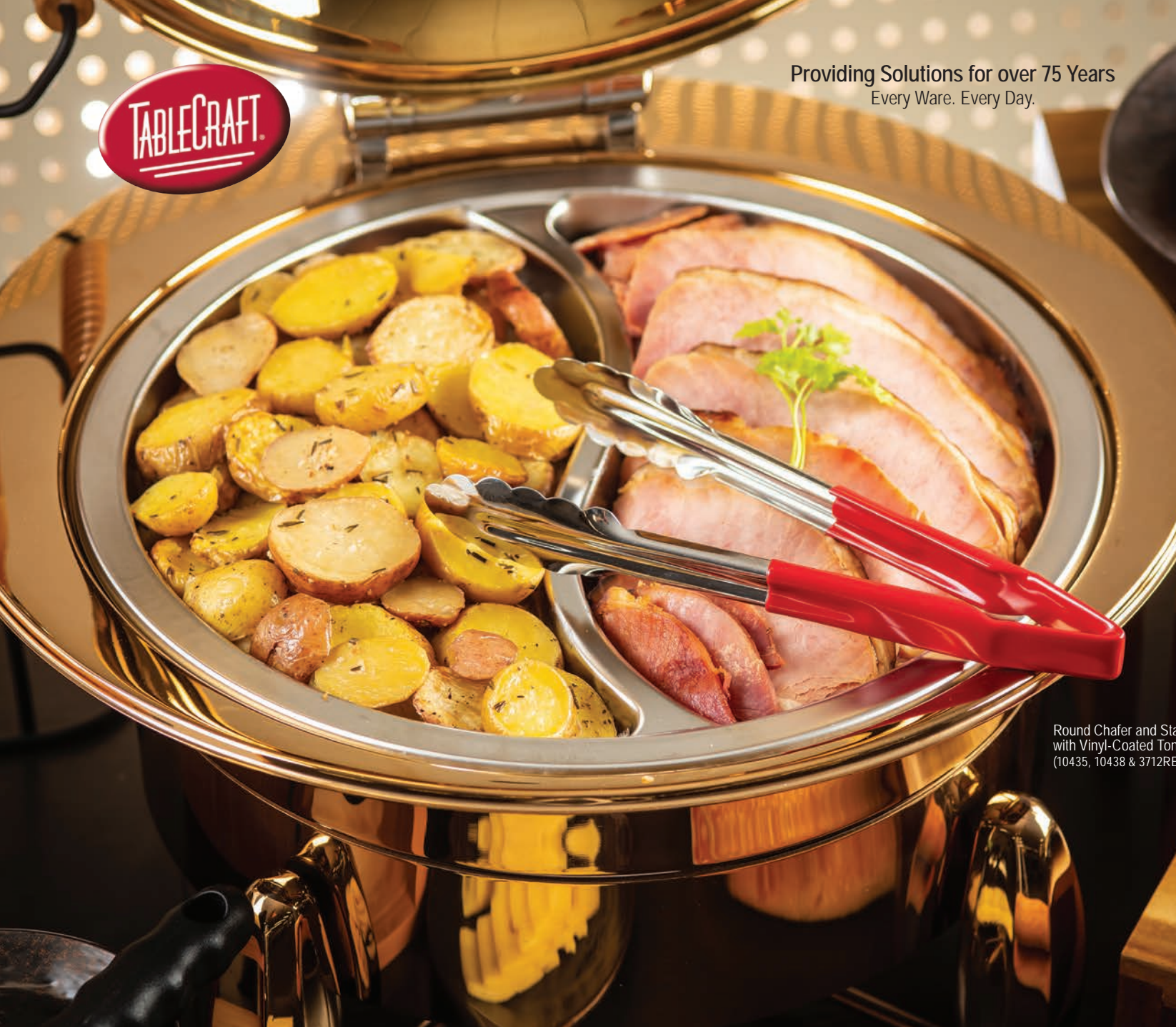
Round Chafer and Stand with Vinyl-Coated Tongs (10435, 10438 & 3712REU)