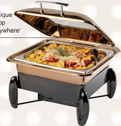
2/3 GN CHAFER Stainless Steel with Gold PVD Coating (10429) and Square Frame, Stainless Steel with Black PVD Coating (10433)