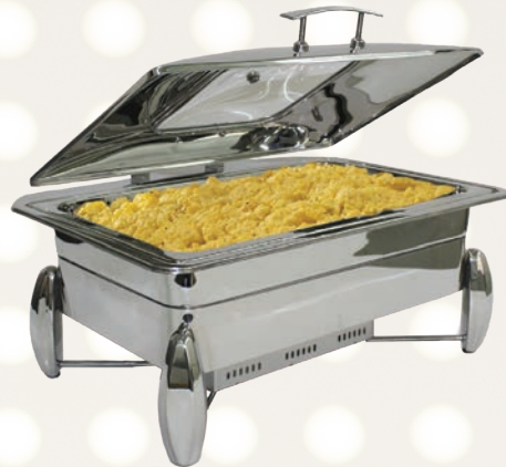
1/1 GN CHAFER Stainless Steel (10422) Stainless Steel Frame (10425)