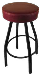
XL Button Top with Black Powder Coat Swivel Frame SL3132