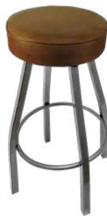
Button Top with Clear Coat Swivel Frame SL2132-CCS