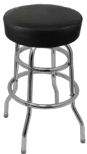
XL Button Top with Double Rung Chrome Frame SL3129

You may also like Oak Street Manufacturing's other Button Top Barstool Options: