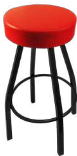
Button Top with Black Powder Coat Swivel Frame SL2132