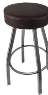
XL Button Top with Clear Coat Swivel Frame SL3132-CCS