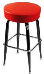
XL Button Top with Gloss Black Square Frame SL3135