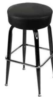
Button Top with Gloss Black Square Frame SL2135