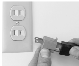
Fig. 6-2 Incorrect