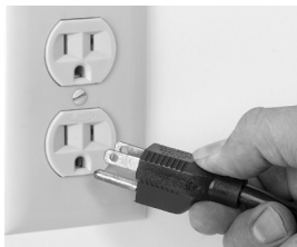
Fig. 6-1 Correct

THIS MACHINE IS PROVIDED WITH A THREE-PRONG GROUNDING PLUG. THE OUTLET TO WHICH THIS PLUG IS CONNECTED MUST BE PROPERLY GROUNDED. IF THE RECEPTACLE IS NOT THE PROPER GROUNDING TYPE, CONTACT AN ELECTRICIAN. DO NOT UNDER ANY CIRCUMSTANCES CUT OR REMOVE THE THIRD GROUND PRONG FROM THE POWER CORD OR USE ANY ADAPTER PLUG (Fig. 6-1 and Fig. 6-2).